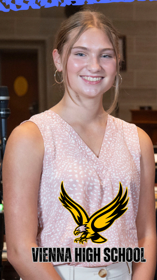
VIENNA HIGH SCHOOL