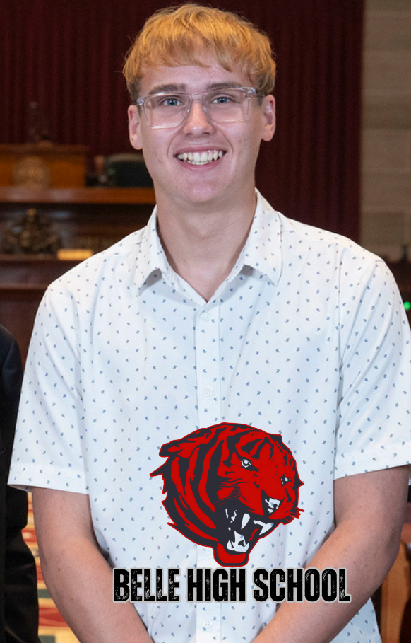
BELLE HIGH SCHOOL